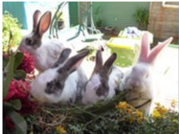
Luke with his 5 brothers when they were babies

Luke was courageous and brave in his short life. His heart condition became extremely difficult for him as it sapped his energy and life force. This gentle creature was much loved by his sister Lily and all of us at Rabbit Run. He is now in his forever home playing with the other bunnies in the gardens of Rabbit Run.