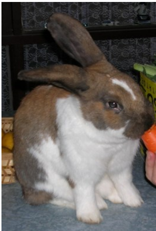
A young Chi at 3 months old

It was a warm summer morning in 2003 when I wandered out to the garden in the sunshine to have a break from a harrowing part of my PhD research which was examining the relationship that people have with the natural world. Bounding across the back lawn leaping for joy was a small bundle of