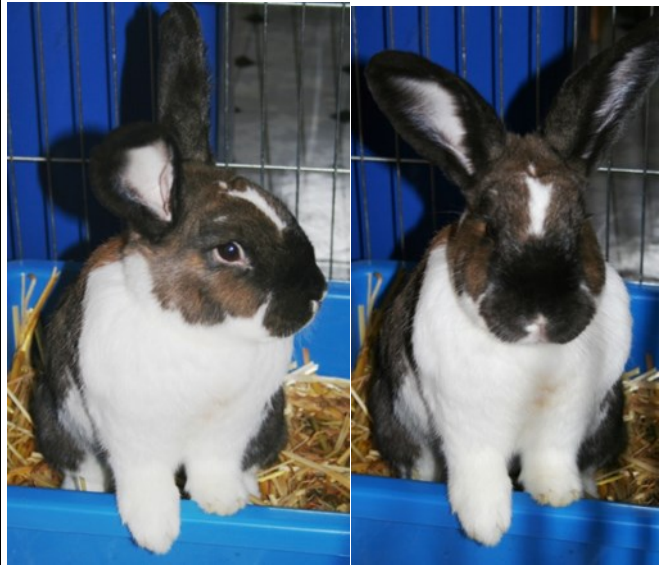
Chi in his favourite stance watching over the other bunnies

In July 2009 we opened Rabbit Run Away Orphanage, a dedicated sanctuary for lost, abandoned and neglected domestic bunnies. Reflecting on that warm summer morning six years ago, we honour Chi's legacy as we celebrate the first anniversary of Rabbit Run-Away Orphanage, a bunny sanctuary dedicated and committed to the rescue and rehoming of these precious creatures.